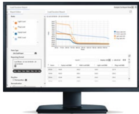
Load Duration Report